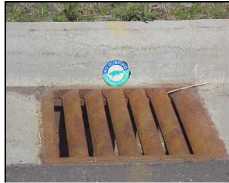
Look for the "NO DUMPING" reminders on your local storm drain. Anything on the street can get into the storm drains, which empty directly into local streams!