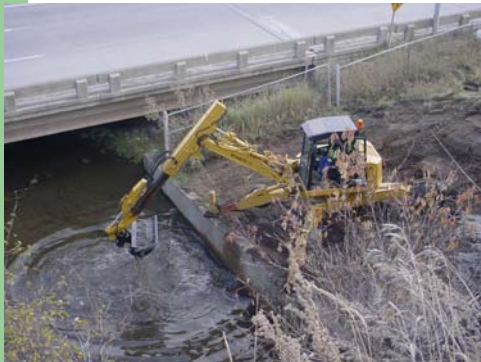
Excavating excess sand and dirt near the mouth of a Duluth creek.

Rain washes dirt and sand into storm drains and straight into your Creek!