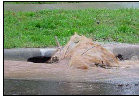
Sweeping up dirt keeps storm drains clean and unblocked.

This stream protection project is brought to you by the City of Duluth and the South St. Louis Soil and Water Conservation District, through funding from the Great Lakes Commission.