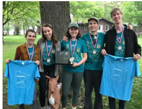
2018 State Envirothon 1 st place winners from Hopkins High School